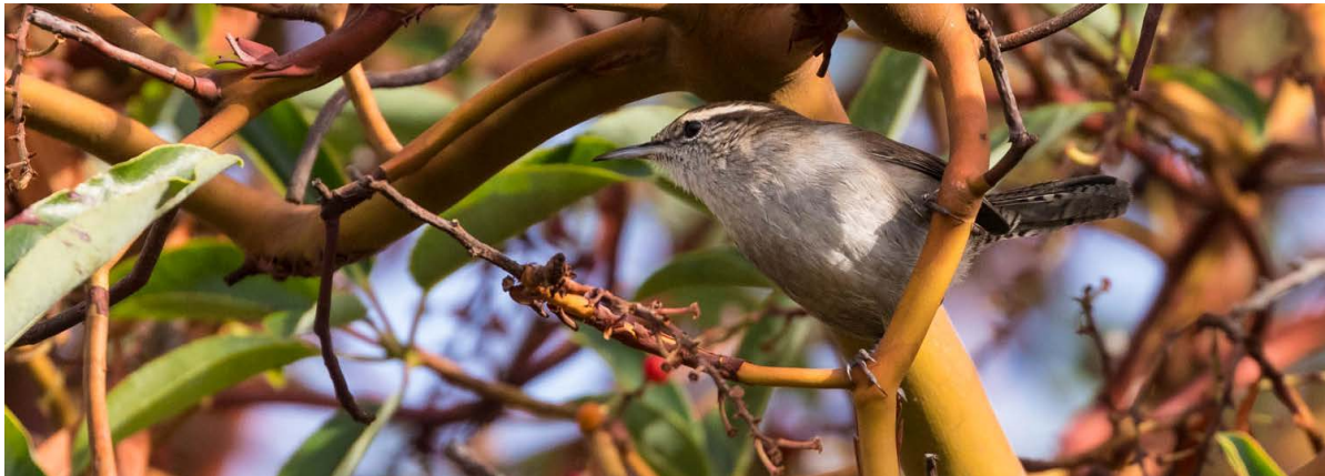
Bewick's wren