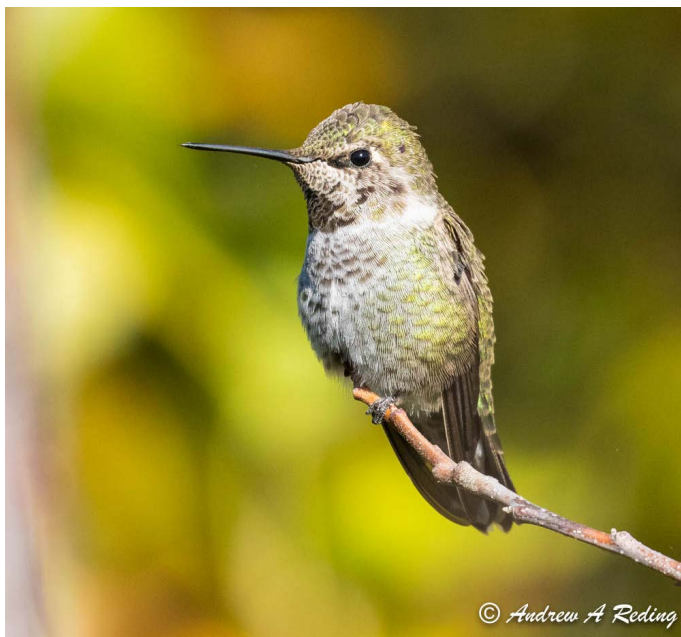
Anna's hummingbird

We are excited to announce a new outing in May called Birds and Brews. This event will begin with a short bird walk in Fairhaven and end at a local brewery with lively conversation. More information on times and location will be available in the May newsletter and on our website.