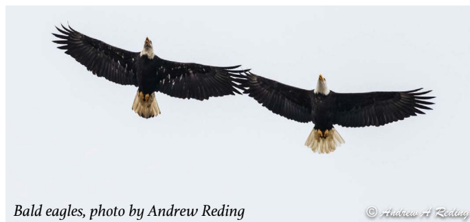
Bald eagles