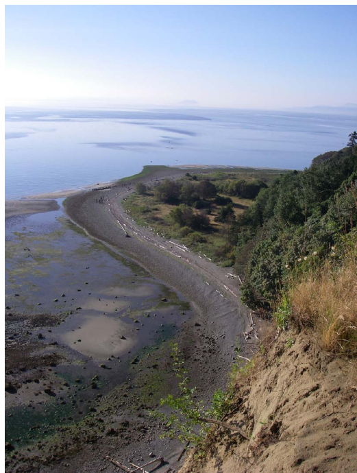
Left: Lily Point bluffs Top right: eagles

Lily Point Marine Park: 2315 APA Road, Point Roberts, WA